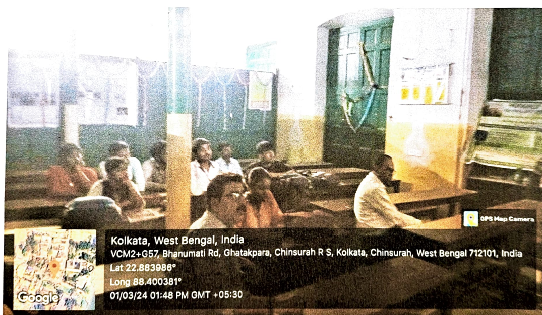
Photographs of the Awareness Programme conducted at Hooghly Mohsin College on 1 st March, 2024 with the students of UG & PG